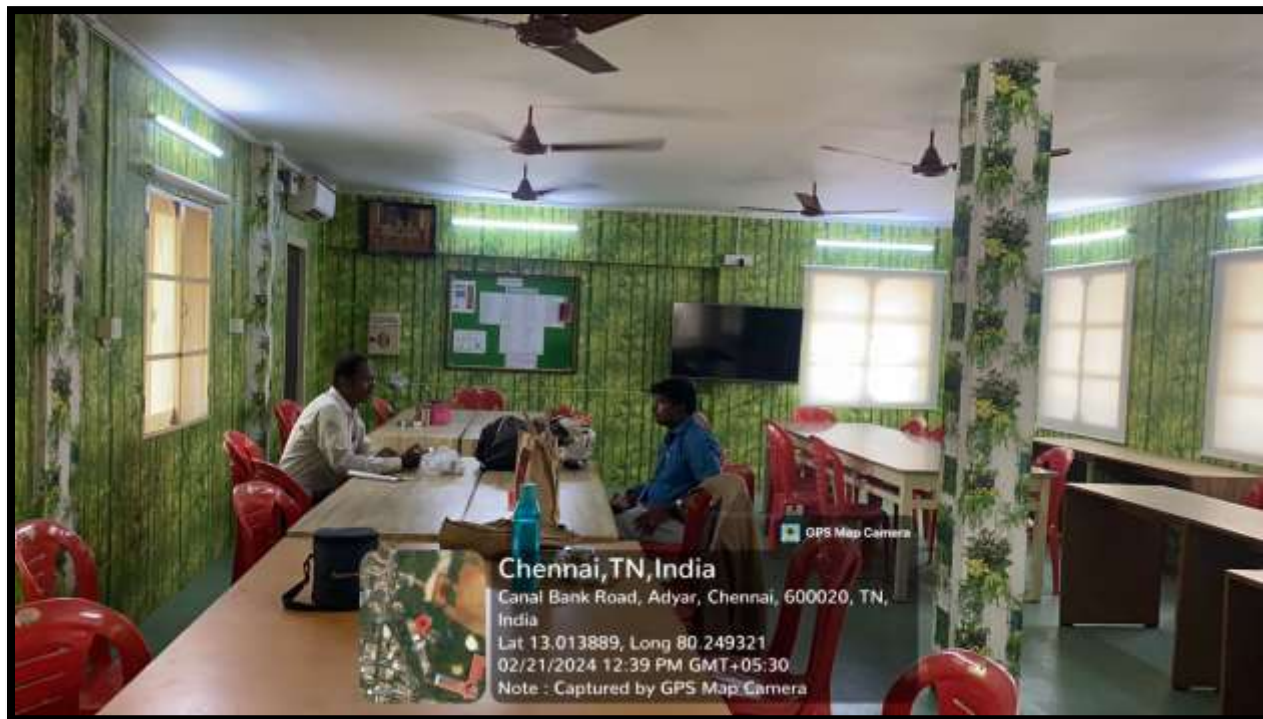
Staff Common Room/Cafeteria