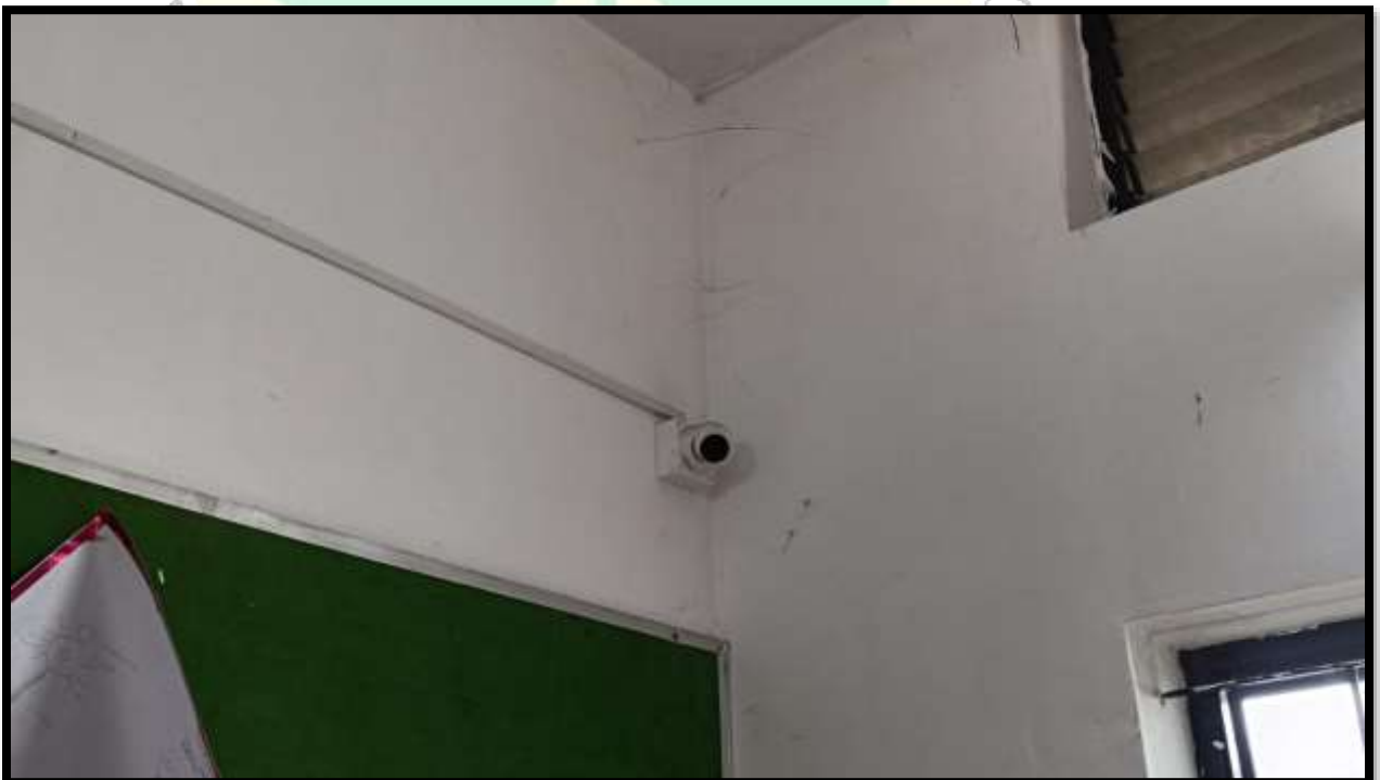
Courtesy: CCTV Cameras and monitoring system installed on the college campus