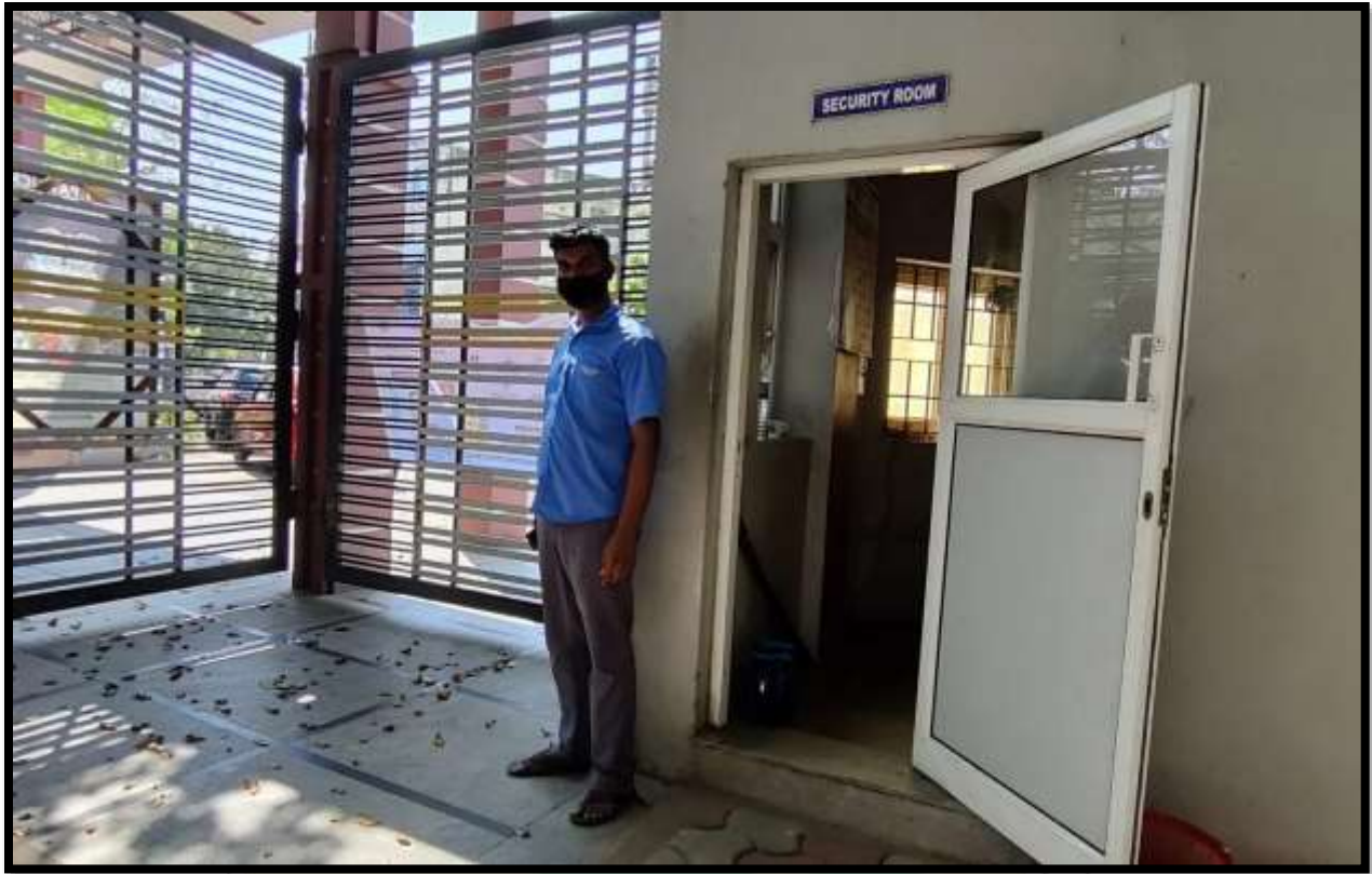
Security guard at the college gate