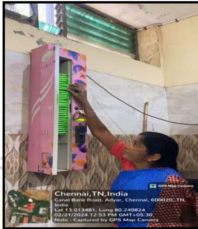
Sanitary Napkins Vending Machine